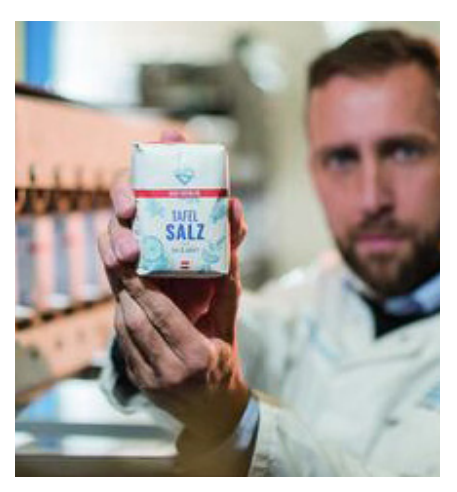
The perfect blend: the high-precision load cells play an important role in ensuring that end customers can trust in a perfect product.