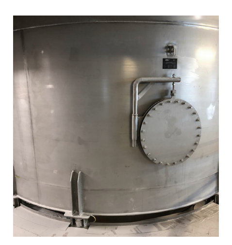
Specialist advice: due to the large capacity of up to 150 metric tonnes, eight load cells were installed in each tank

to transfer the weight values directly to their own system. Furthermore, the integrated Minebea Intec FLEXLOCK mounting kits minimise the impact of movements on the weighing result.