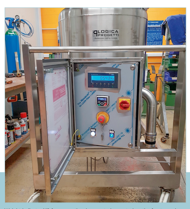
Weight indicator X3 for magnetic mixer control mounted on the front panel. The mobile mixer with weighing module Novego is made entirely of stainless steel, in order to ensure maximum sterility