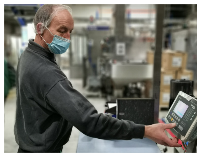
The user interface of the terminal scale Combics 3 enables intuitive operation.