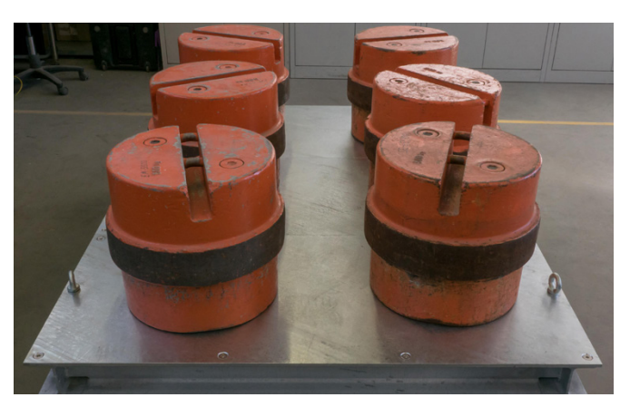
The modified installation kits allow easy maintenance despite the high loads.

The Maxxis 5 process controllers are mounted in a heatable housing (for use in the specified hazardous area) to guarantee the optimum operating temperature and the required explosion protection of the controller.